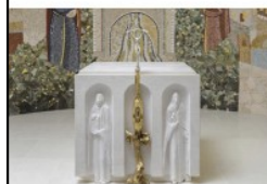
First-Class Relic of St. John Paul II's blood

Space is limited. The cost is $20 per person, up to a maximum of $75 per family. This offsets the cost of a boxed lunch and provides a donation to the shrine.