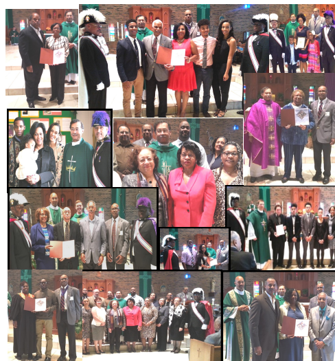
Family The Pride of Our Neighborhood